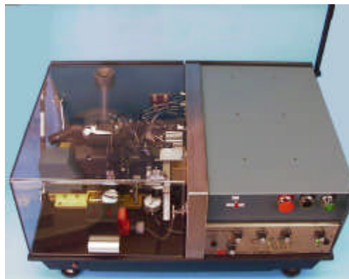
Model 015 Die Sorter

Vacuum generator– This generates 25” Hg vacuum from 80 PSI Air.